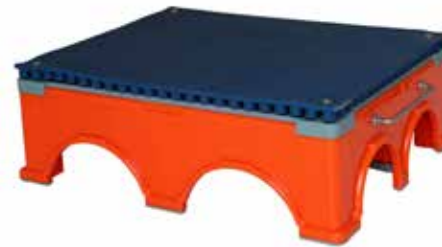
Single Surgery Riser

ideal where ergonomic risers are needed in the operating room.