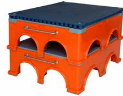
Double Surgery Riser

SmartCells® Runners: ideal for larger operating room areas, or wherever patients may be in danger from falling.